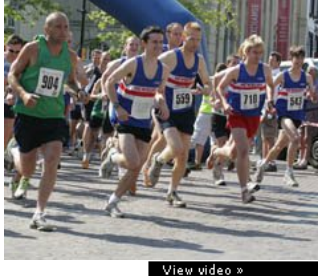
View video »

Got a news story for the site? Click here